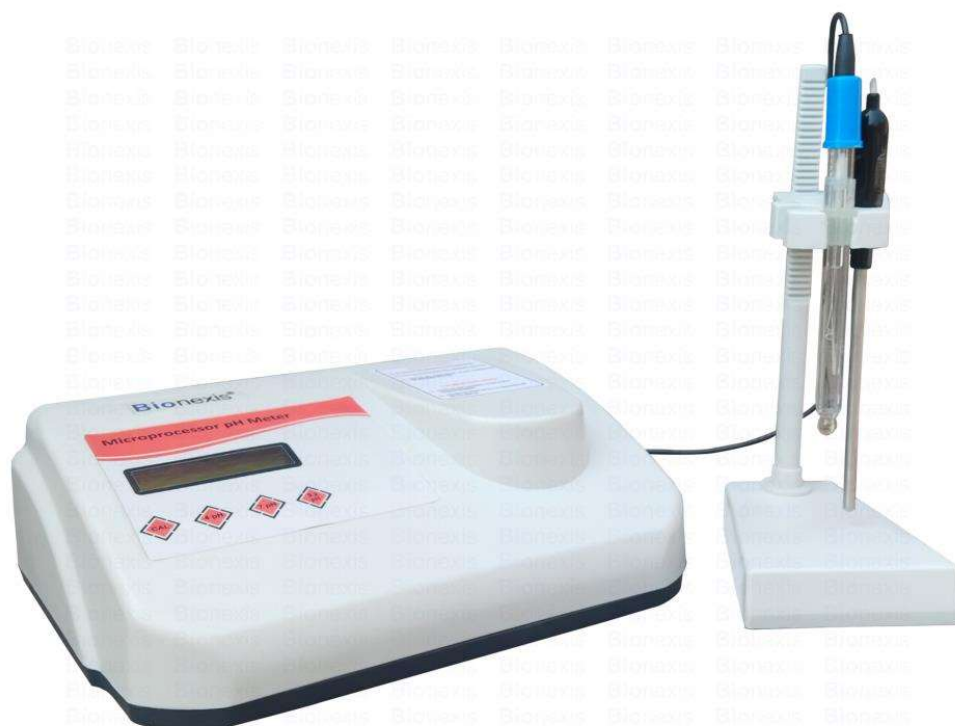
Smart Ph Meter