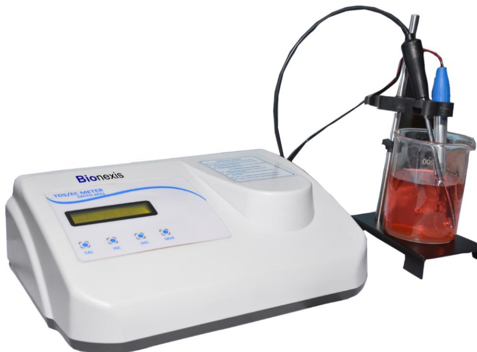
Microprocessor Based TDS/Conductivity/Temp. Meter