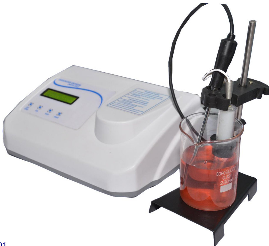
BNDO001 DO Meter