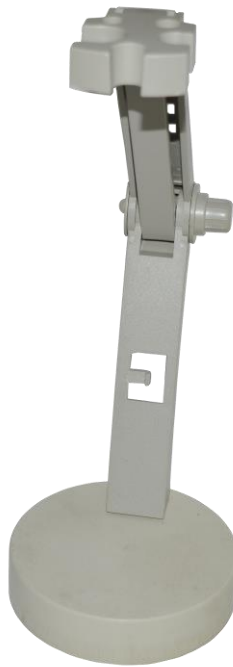
BNST002 Stand Model 2