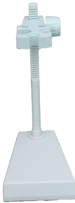
BNST001 Stand Model 1