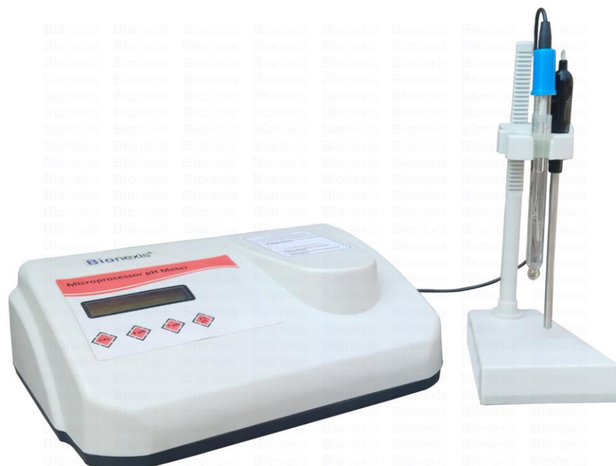
Smart Ph Meter